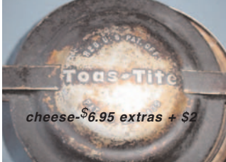
cheese-$6.95 extras + $2

hamburger, veggie burger, quesadilla, BLT, veggie meatball hero, mac and cheese, peanut butter and jelly, tuna sandwich, hotdog, grilled cheese, pancakes, fluffernutter, taco, chicken sandwich, french toast, pasta